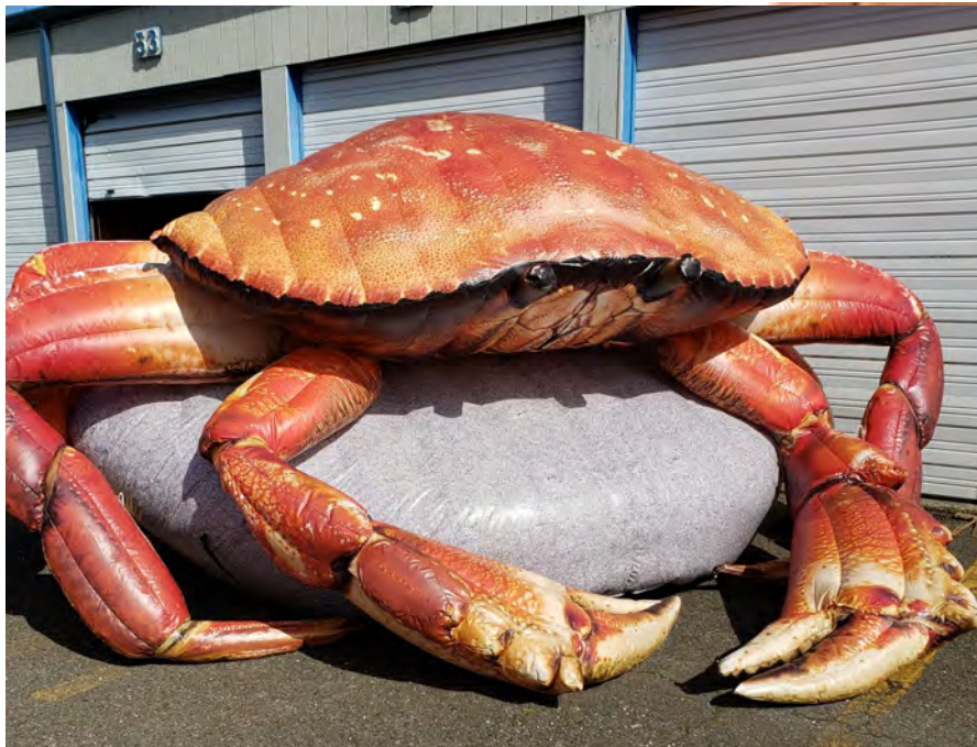
Look out, folks, there is a new Louie in town. Meet mid-size Louie, coming soon to an event near you!