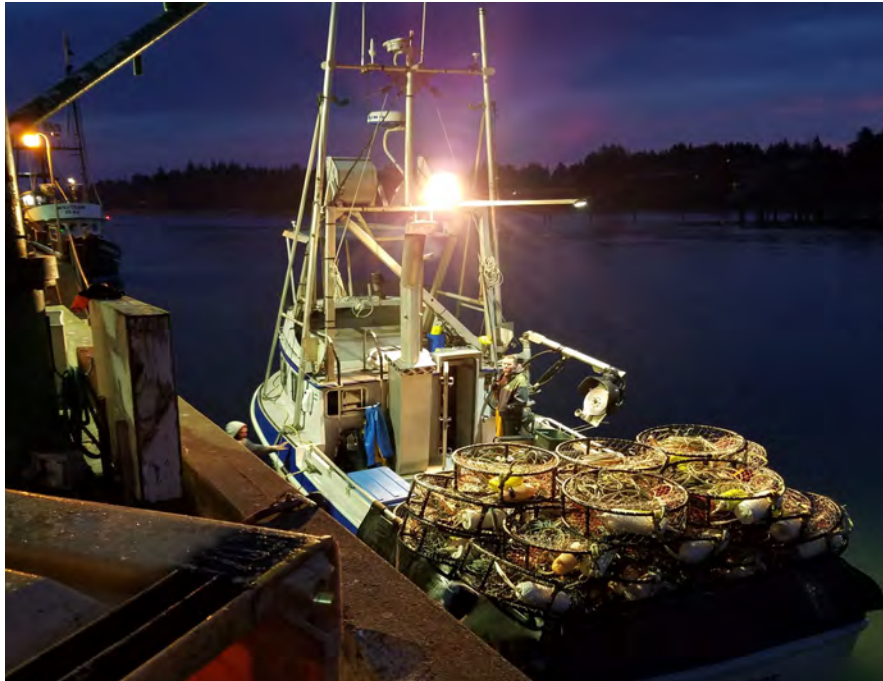
First round of testing showed meat-fill was close, but a second round would be needed.