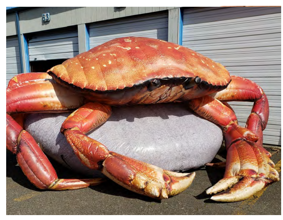
Look out, folks, there is a new Louie in town. Meet mid-size Louie, coming soon to an event near you!