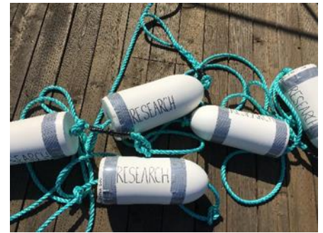
Surface floats on the research gear.

For questions or lost and found research gear, please contact: